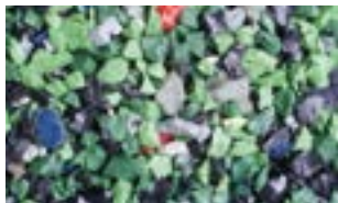
Green Nike Grind