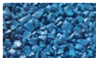
Dark Blue RAL 5009