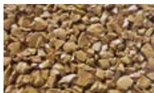
Earth Yellow RAL 1006