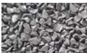
Medium Grey RAL 7012