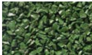
Rainbow Green RAL 6025