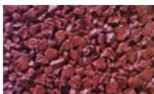
Red RAL 3016