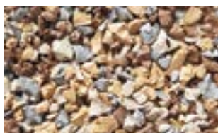
Earth Blend EPDM Blend