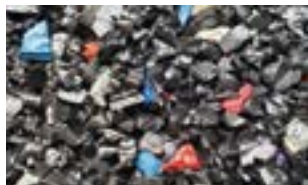
Black Nike Grind