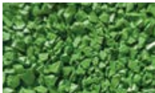
May Green RAL 6017