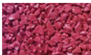
Rose RAL 3017