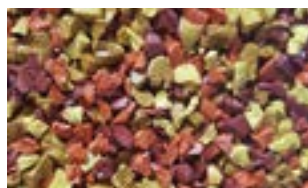
Fire Blend EPDM Blend