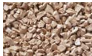
Beige RAL 1001