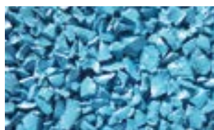
Teal RAL 5024