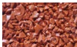
Orange RAL 2004