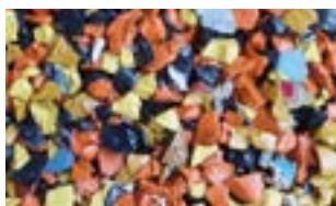
Flame Nike Grind