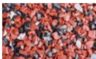
Red Nike Grind