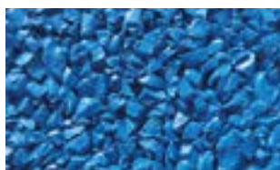
Sky Blue RAL 5015