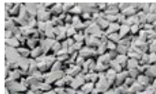
Light Grey RAL 7035