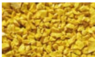
Yellow RAL 1012