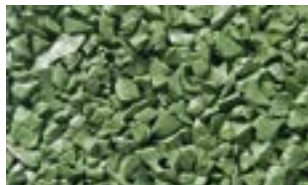
Reseda Green RAL 6011