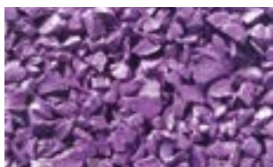
Purple RAL 4005